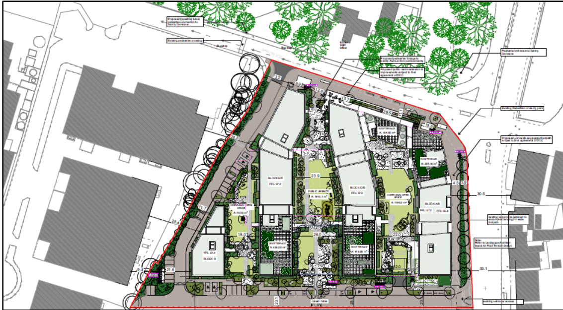
Figure 5.1 Proposed Site Layout and Location